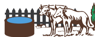
20 offstream stock watering points installed