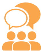
Many field days and community events