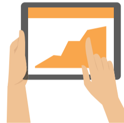
Supported With Sound Science