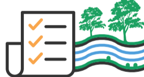
7 wetland management plans