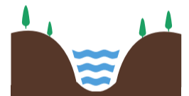
8 eroded gullies restored