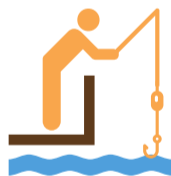
Over 1,000 recreational anglers participating in carp removal activities