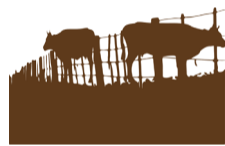
30km of river frontage fenced