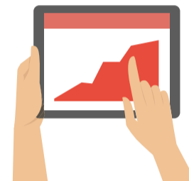
Supported With Sound Science