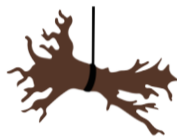
Removal of instream snags