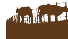
60km of river frontage fenced