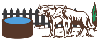
9 offshore stock watering points installed