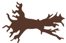
442 snags installed at 11 sites