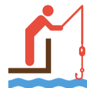
804 recreational anglers participating in Carp removal