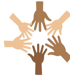
An Empowered Community