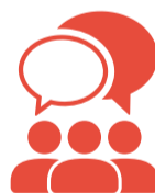
Many field days and community events