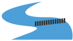
Barriers to fish passage