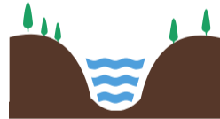
3 eroded gullies restored